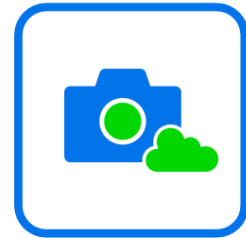
DAM Connector with Clouinary Platform